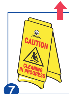
7 Remove safety signs.