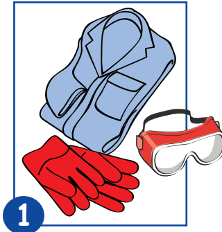
1 Use appropriate PPE as indicated in COSHH/REACH data.