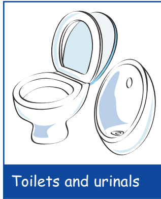
Toilets and urinals