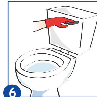
6 Flush with clean water.