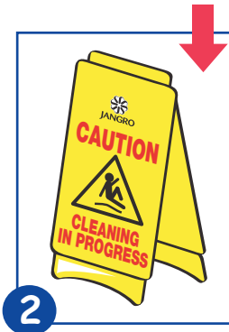
2 Place safety signs.