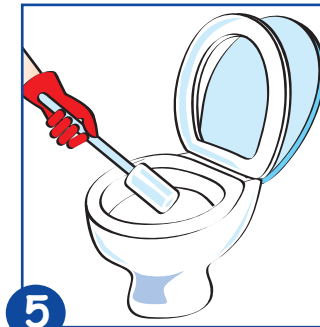
5 Agitate with brush if necessary.